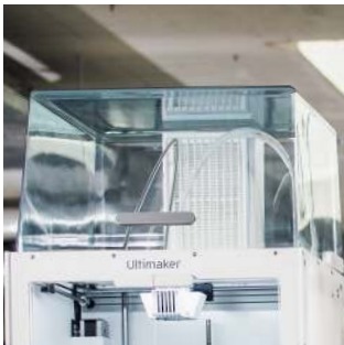
Air Manager EPA filter removes up to 95% of UFPs