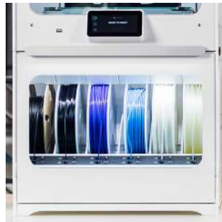
Material Station Simplify and automate material handling