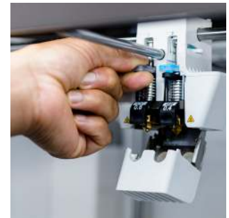
Print core CC Ruby-tipped for printing abrasive composites