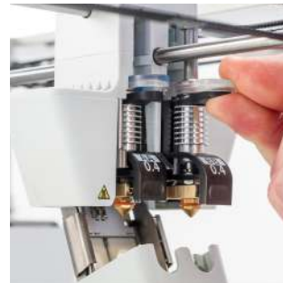
Print cores AA and BB Quick-swap nozzles for build and water-soluble support materials